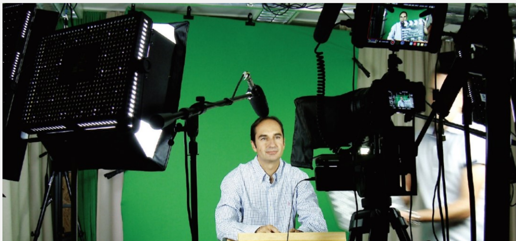
During the video recordings of the “Basic knowledge on microfinance” part