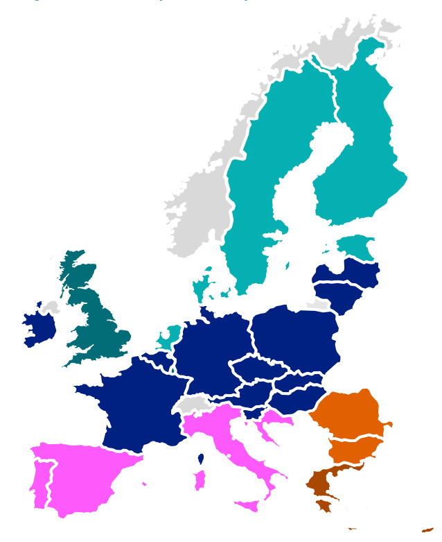
Figure 1: Country cluster by financial inclusion, social inclusion, and financial sector development

High Financial Development Regions Financial and Social Inclusion Regions Financial Inclusion and Limited Social Exclusion Regions Limited Financial Inclusion and Social Exclusion Regions with Financial Development Potential Financial and Social Exclusion Regions Financial and Social Exclusion Regions with Low Financial Development Potential